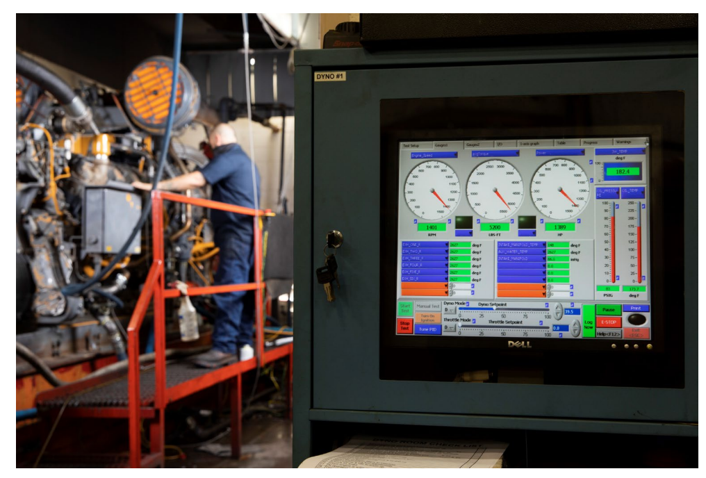
3516 JEF on Dyno

3300, 3400, 3500, and 3600 Series Engines