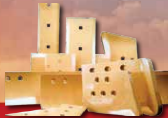
Bucyrus Blades™ Cutting Edges