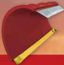
Bucyrus Blades™ Snow Plow Edges