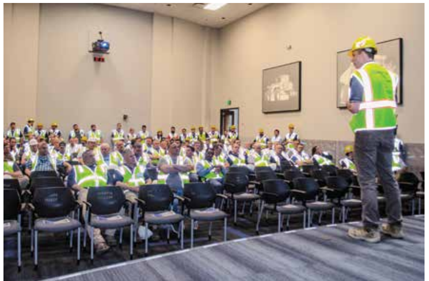
During Demo Days at the Cartersville Customer Center, Komatsu experts provide valuable insights about maximizing machine production and more.

One way we do that is with events, such as Demo Days, where distributors can bring customers to our Cartersville Customer Center to operate machinery, and our experts provide insight into maximizing machine usage as well as other valuable content.