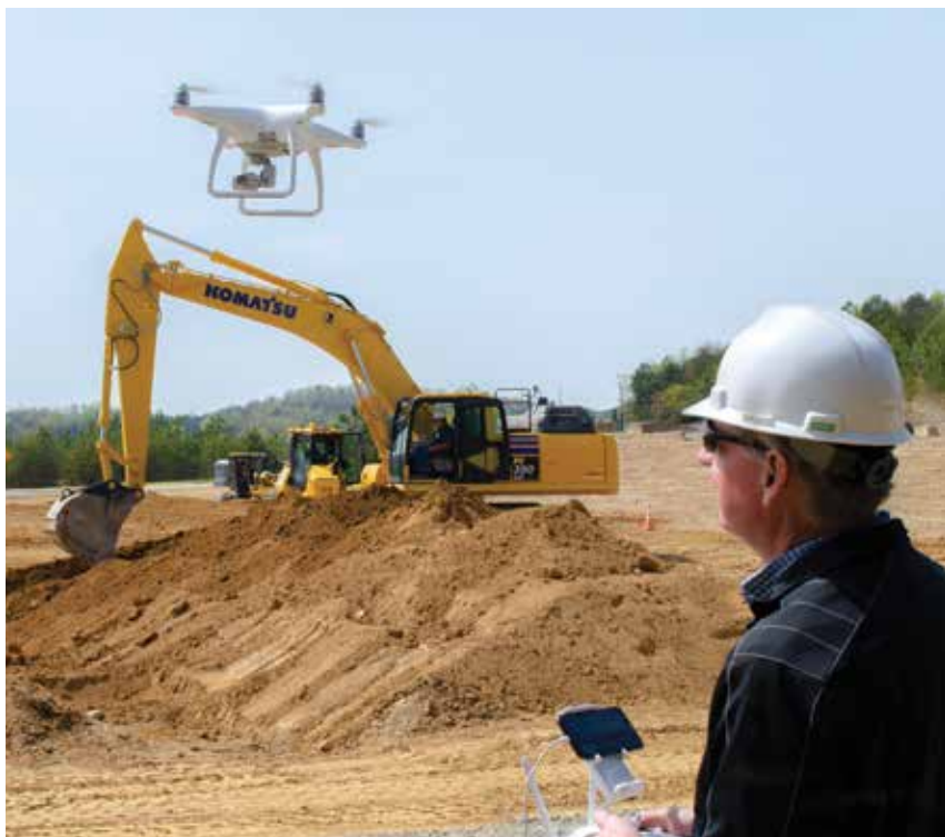
Large companies that use drones are overwhelmingly positive about the technology, citing the ability to capture more information, save time and increase efficiency among the primary benefits, according to a recent study. Almost 90 percent of companies that use drones said they saw a return on investment within a year.

Two percent of respondents plan to start a drone program within a few months. Another 7 percent said they will begin using drones at some time in the future. ■